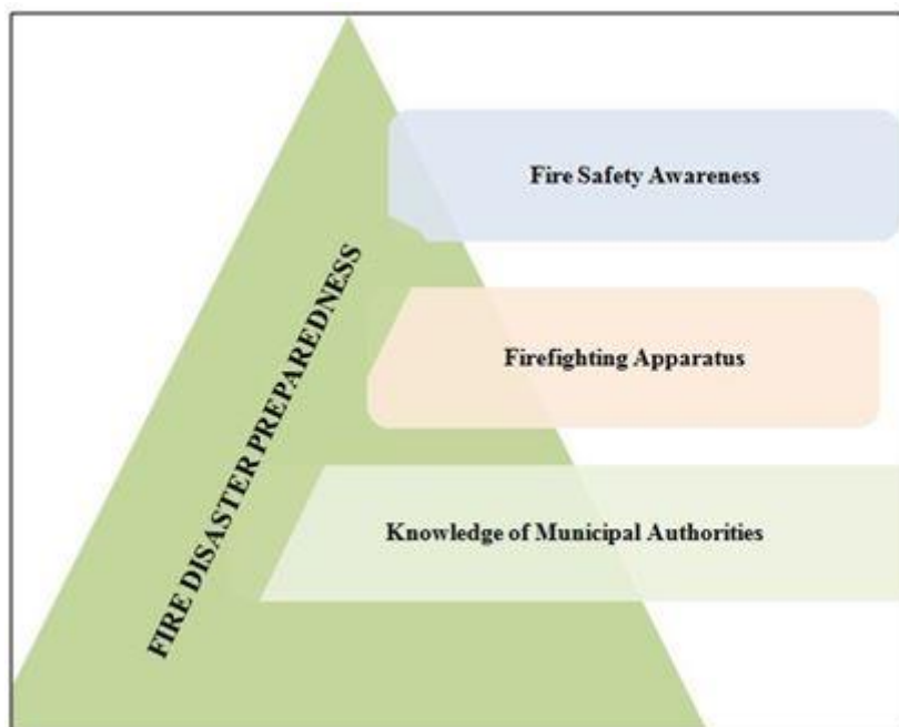
Figure 1: Conceptual Framework for Indicators of Fire Disaster Preparedness Source: Authors' Conception (2019)