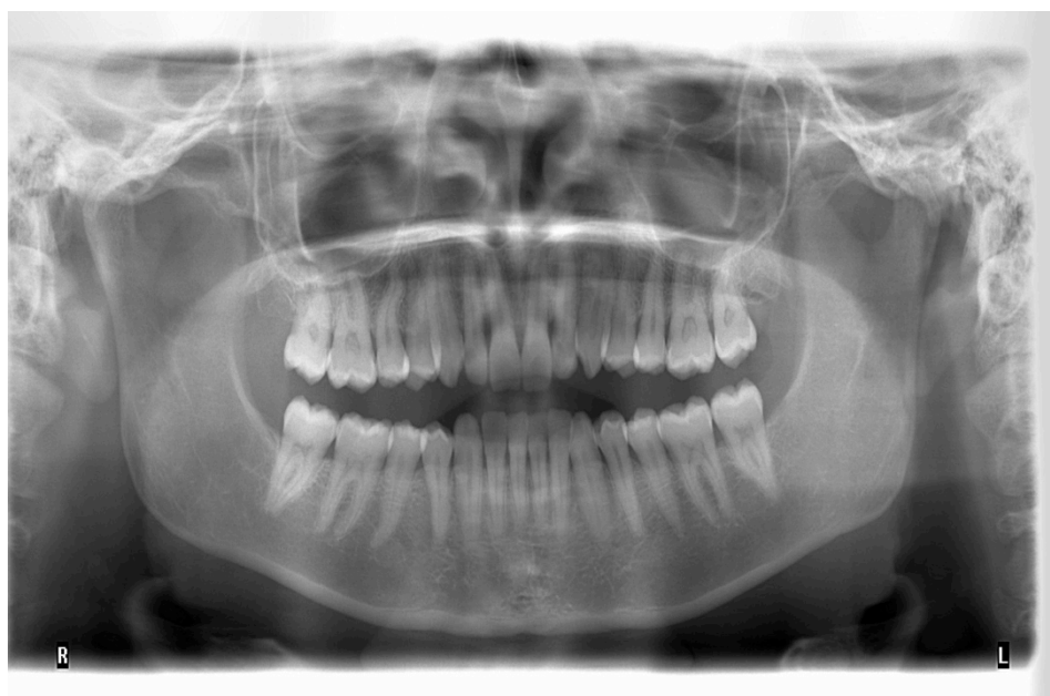
Figure 4. Initial panoramic radiograph

Cephalometric analysis (Fig 5) revealed a skeletal class II due to mandibular retrusion (Table 2), growth in the vertical direction. Also the analysis showed mesofacial biotype.