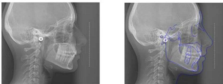
Figure 5. Initial cephalometric profile radiograph and cephalometric tracing

Cephalometric analysis (Fig 5) revealed a skeletal class II due to mandibular retrusion (Table 2), growth in the vertical direction. Also the analysis showed mesofacial biotype.