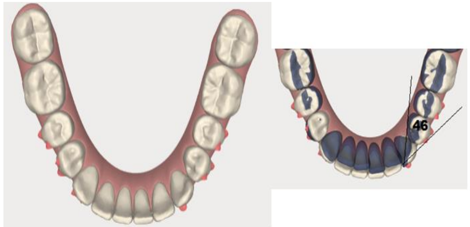
Figure 10. Superimposition of dental movement (Initial blue-final white) shows the degrees of rotational correction.