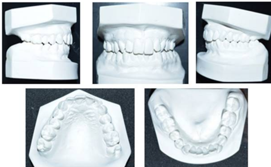
Figure 3. Initial dental cast

The transversal analysis was measured starting at first premolars, second premolars and first upper molars (vestibular cusps) and lower molars (central fossae) showed normal values (Table 1).