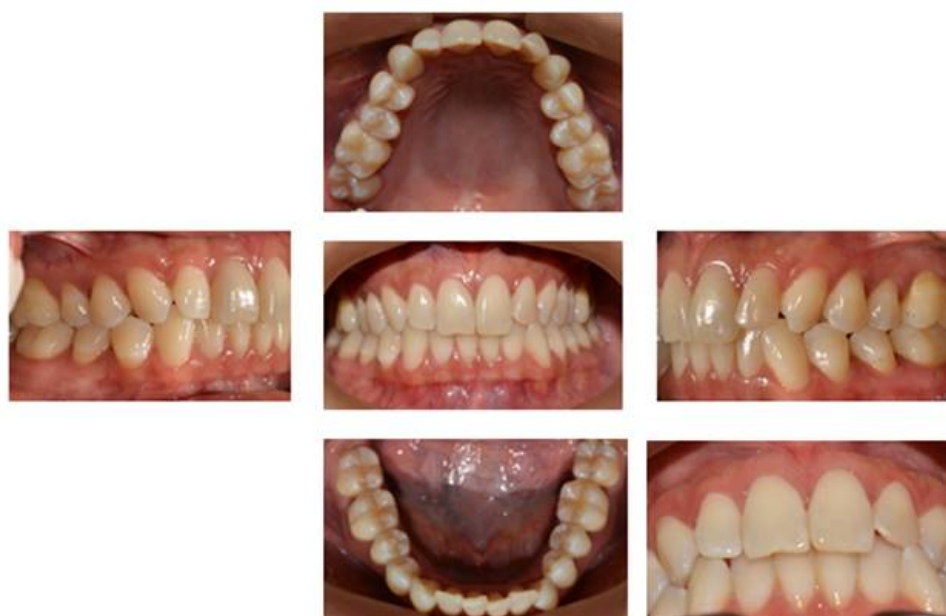
Figure 2. Initial intraoral photographs

Intraoral clinical examination revealed a bilateral Class Imolar relationship , canine distoclusion of 1/4 unit bilateral, horizontal overjet of 3.5mm and vertical overbite of 3.5mm; crowding in both upper and lower arches. Deviated dental middle line and severe rotation of lower canine (33 rotated 46°) (Fig 2).