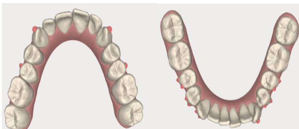
Figure 6. Attachments on upper and lower teeth. Severe canine lower rotation (33)

Each aligner was worn for 2 weeks (15 days). No inter-proximal reduction was indicated for the correction of the crowding. To improve the results, Invisalign introduced optimized attachments to achieve a greater predictable rotation movement for premolars and canines (Fig 6).