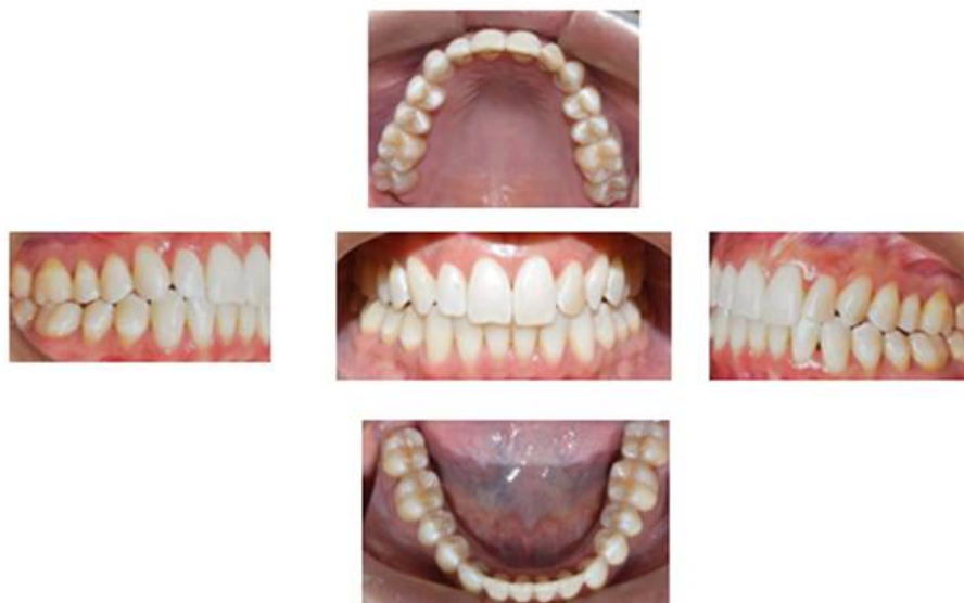
Figure 8. Intraoral Photographs at the end of treatment