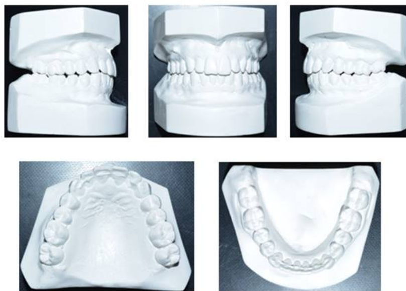
Figure 9. Final dental cast