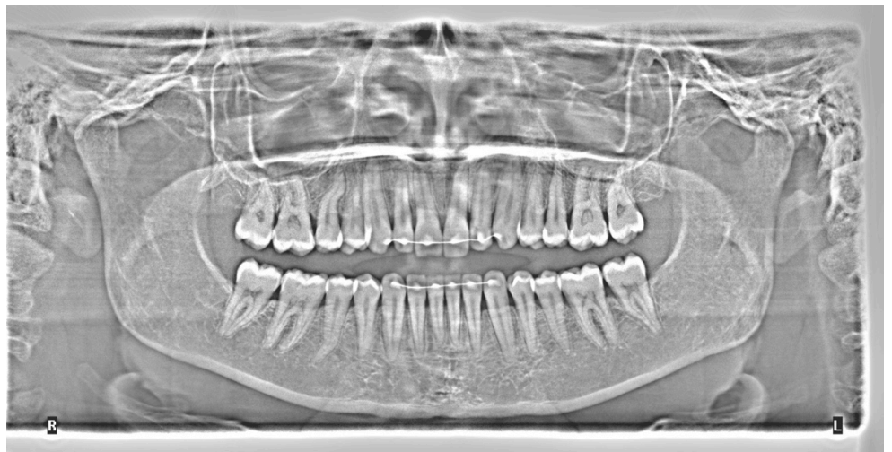
Figure 11. No obvious root resorption was radiographically evident at the end of treatment